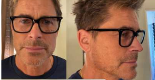
"HE IS A HEARTROB"

PERSONAL HYGIENE IS ESSENTIAL TO YOUR GROWTH!