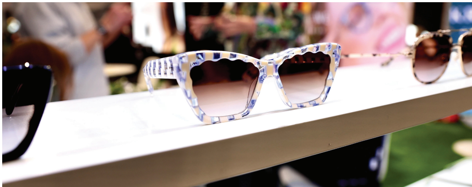
EXHIBIT HALL HOURS